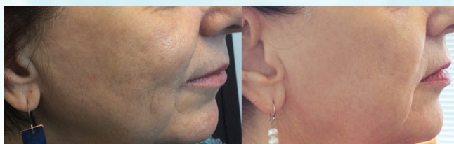
Before & after 1 SkinPen microneedling treatment

SkinPen, or Microneedling , promotes collagen production to soften fine lines and wrinkles, improve pore size, minimize scarring and provide overall healthier skin.