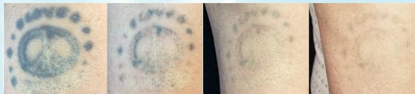
Before, first, second and third laser tattoo removal treatment

This month you can try it before you buy it with our one time one price for any tattoo up to 6x6 inches in size. Our state of the art Enlighten Laser can remove tattoos of any color and size with its multiple wavelengths.